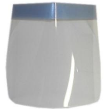
Disposable shield mask